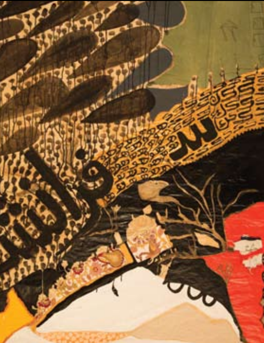
Fathi Hassan: Ask Frenche , mixed-media on paper